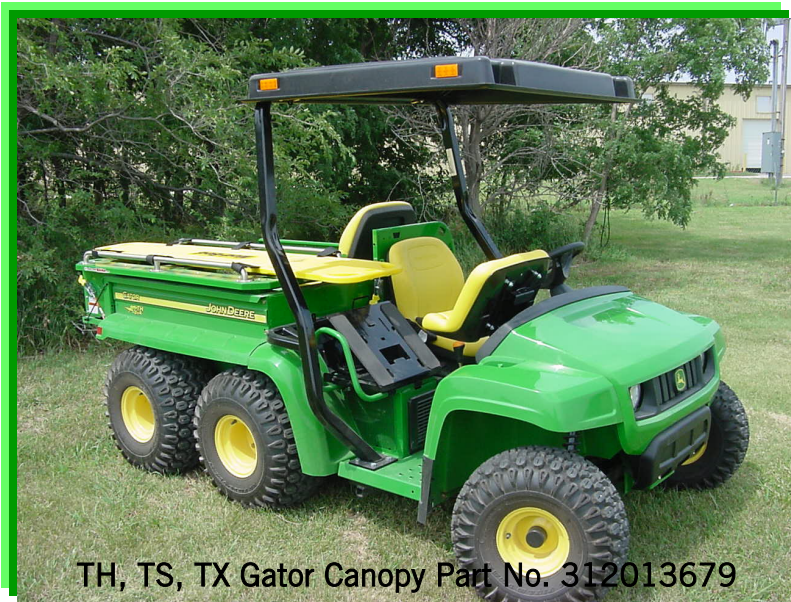
TH, TS, TX Gator Canopy Part No. 312013679